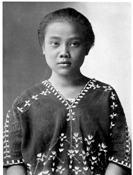
Photo of a Burmese woman wearing a traditional sarong.