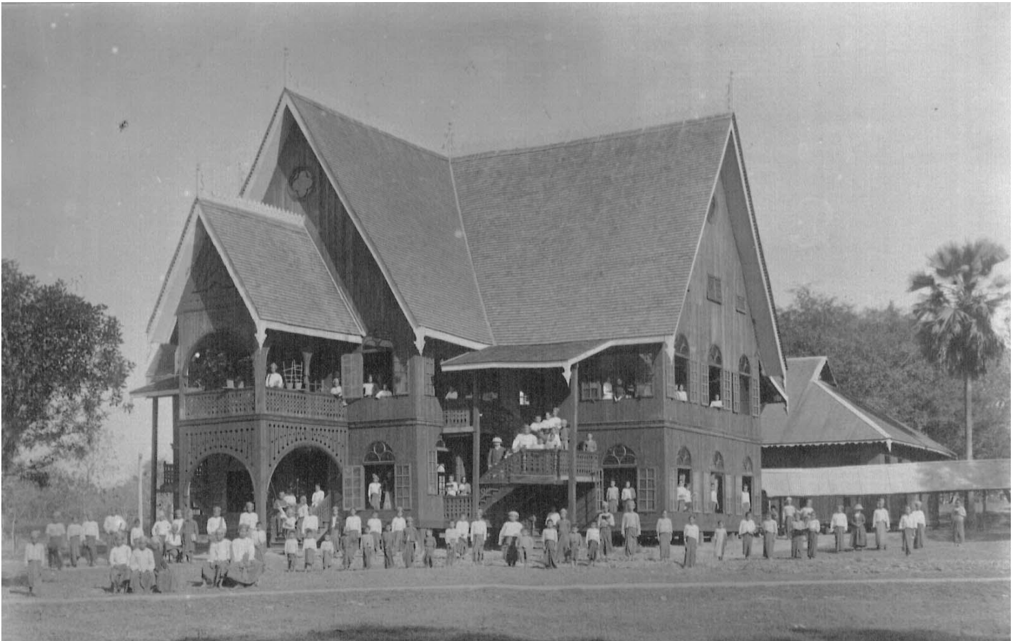
Missionary school in Banmaw.