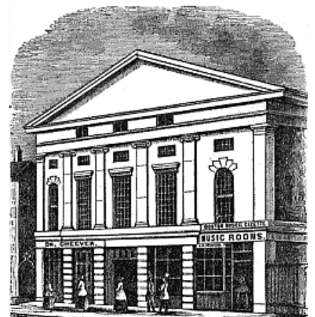
Tremont Temple Baptist Church in Boston. 1851 depiction.