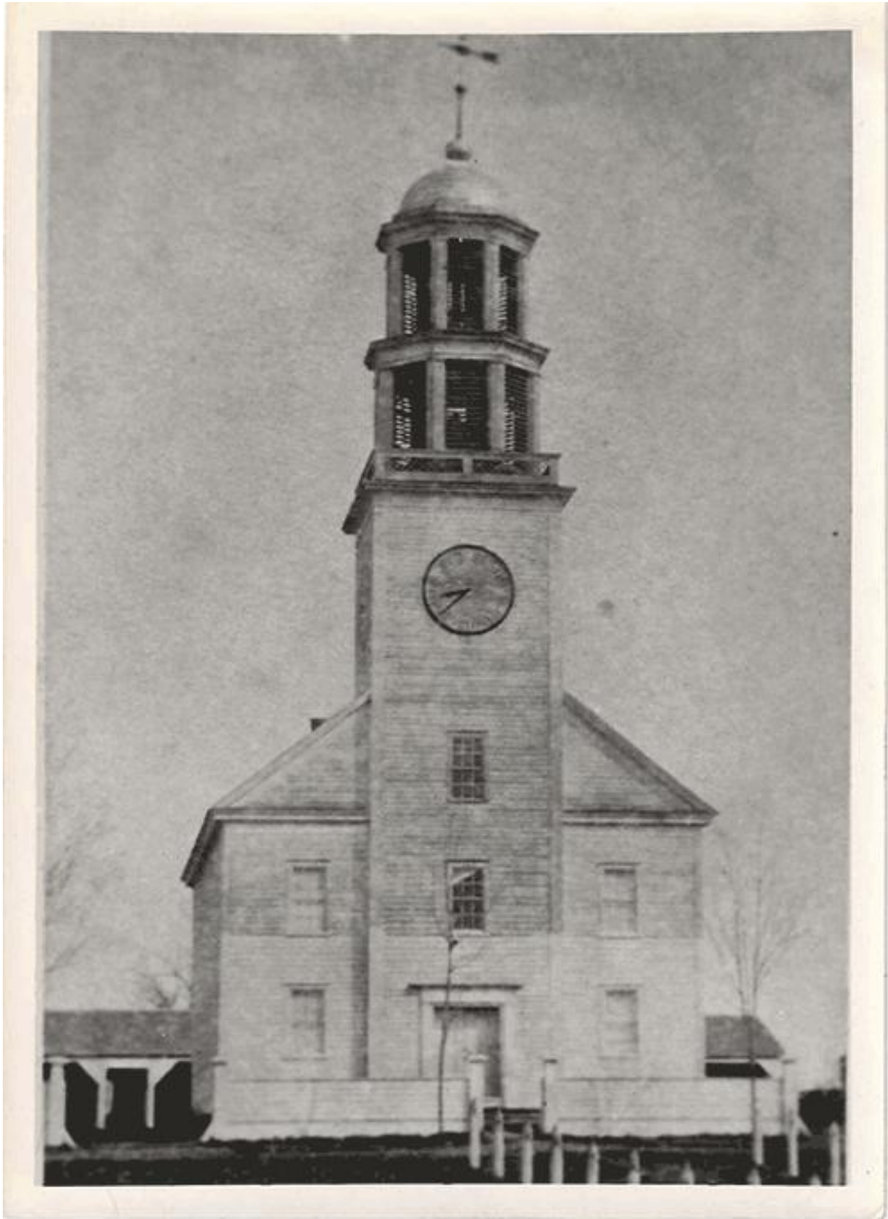
Second church, circa 1794; removed in 1865.