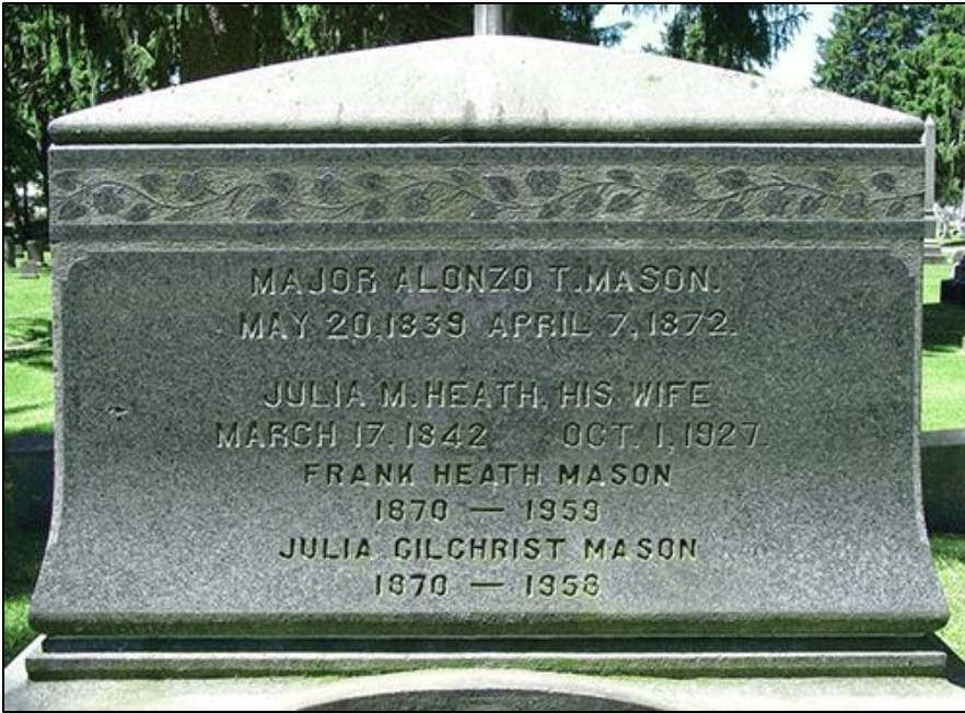
[3] The Mason Memorial located in the Greenwich Cemetery, Greenwich, NY